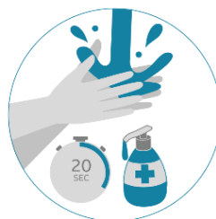
Wash your hands